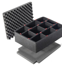
1525TPKIT TrekPak Case Divider Kit