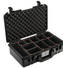
1525TP With TrekPak Divider System