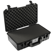
1525WF With Foam