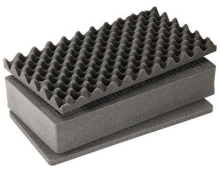
1525AirFS 3 pc. Replacement Foam Set