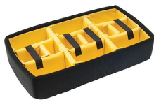
1525AirDS Padded Divider Set