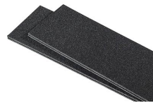
1525TPDIV Extra TrekPak Dividers