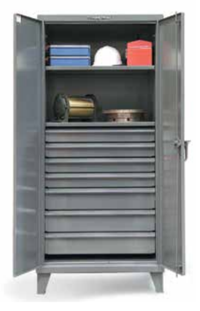
Product Number... ₹ 36-242-7DB