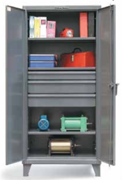
Product Number... ₹ 36-243-3DB

*CUSTOM SIZED TO MEET YOUR SPECIFIC REQUIREMENTS