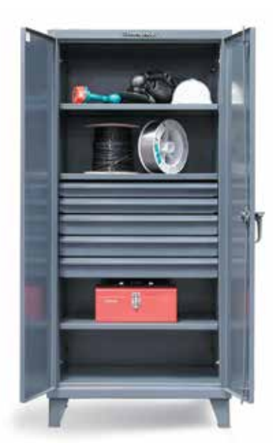
Product Number... 36-243-5DB

Width x Depth x Height... 36" x 24" x 72"